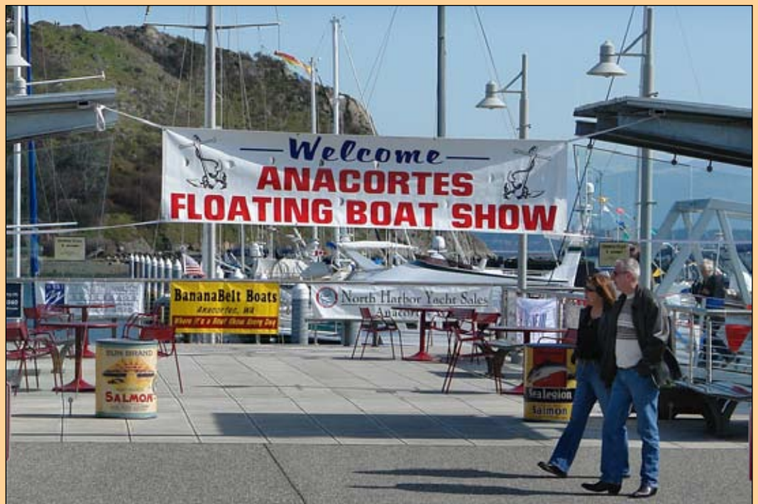
From now on, the level of annual activities at Cap Sante Boat Haven will rise, starting with the March 18-20 Anacortes Boat Show and the Anacortes Salmon Derby on March 26 and 27. See partial events schedule, page two.