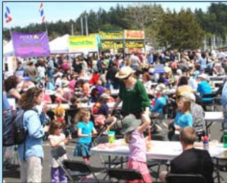
Waterfront Festival, May 21-22