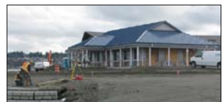
Public Seafarers' Park building back in place.

Park. The cleanup has now entered its third and final phase, with a re-opening of beach and dock facilities tentatively scheduled for Friday, May 20.