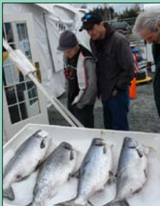
Last year's Anacortes Salmon Derby featured some whoppers including the four fish pictured here.

Tickets sold fast for the 5th Annual Anacortes Salmon Derby, a scholarship event that quickly claimed notoriety for top prizes and overall quality of operations. Cap Sante Boat Haven will be bustling with activity again on March 26 and 27 as derby participants seek prizes including $15,000 for top fish.