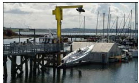
Several boats including the Skye Rocket (above) were launched recently following a celebration ceremony at the Port of Anacortes small boat launch. See more photos, page two.