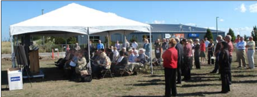
Guests gathered on the academy site, between "R" Avenue and the Northwest ESD facility.