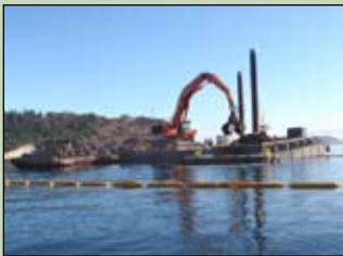
Fidalgo Bay dredging, Cap Sante in the background. A great quantity of wood debris and pilings have been dredged.

7 p.m. Regular Commission Meeting Commission Meeting Room 1st and Commercial Avenue