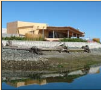
Anthony's restaurant at Cap Sante Boat Haven will be approximately 6,800 square feet in size, with a 2,150 square-foot deck.

Anthony's progresses toward New Year's opening at boat haven