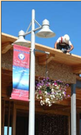
Crewman works on east face of restaurant roof, along esplanade.

Anthony's progresses toward New Year's opening at boat haven