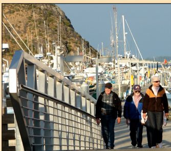
All docks, including the commercial fishing docks, are open to the public.