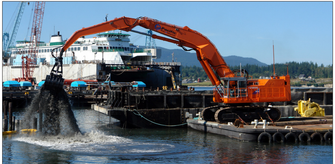
Crews contracted by Dakota Creek Industries continue dredging at the shipyard site on the Guemes Channel.