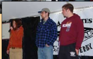
Past scholarship winners express thanks.