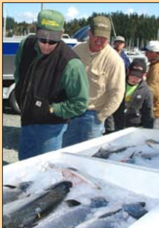
Envious fishermen file past display of top derby catches.