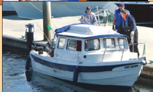
Port launch crews handled hundreds of boats.