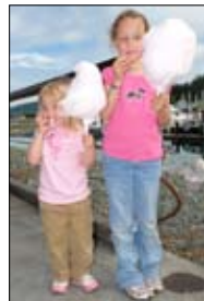
Cotton candy treat for sisters.