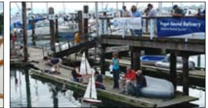
A sure favorite among festival goers is the armada of remote control model boats.