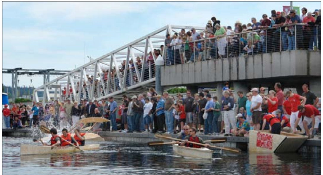
Despite a couple of wet launches, all but one team completed the course in the crowd-pleasing "Quick and Dirty Boat-building" event at Cap Sante Boat Haven. See more Waterfront Festival scenes on back page.

COMPETITION: This annual event encompasses rowing, sailing, seamanship and navigation among teen teams including a Sea Scouts crew from Anacortes (long boat Elizabeth Bonaventure, above right). Teams came from other Northwest communities including Port Townsend, Vashon Island, Tacoma, Kent and Olympia. Cap Sante Boat Haven, Seafarers' Memorial Park and Fidalgo Bay bustled with team activities on Friday, Saturday and Sunday, May 29-31. Pay a visit to www.pacificchallenge.com for details.