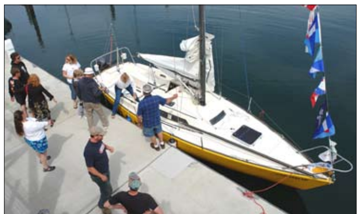
Folks dock after a morning cruise, compliments of Anacortes Yacht Club.