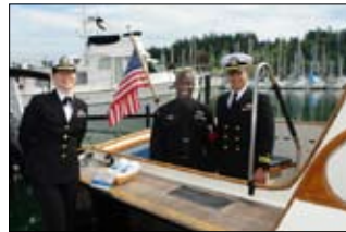
The U.S. Navy was well represented by this smiling crew.