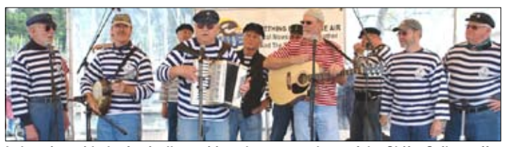
In keeping with the festival's maritime theme, members of the Shifty Sailors offer songs from the sea.